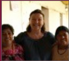
Be inspired by Guatemala's cultural heritage expressed through color, weaving and intricately embroidered designs.

Day 1: Arrival in Guatemala City. Ground transportation from the airport to Antigua, colonial city and former capitol of Guatemala. Welcome dinner with your tour hosts.