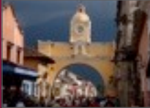
Enjoy the natural beauty of Guatemala's majestic Lake Atitlan, rural mountain villages, and the architectural splendor of an old colonial city.

Day 5: Learn about the colorful Sololá textiles. Visit weaving, jewelry making, medicinal plant garden and organic cotton-spinning cooperatives, who will share their skills and you will have a chance to practice the age-old craft of weaving.