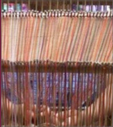
Immerse yourself in the hustle and bustle of lively artisan markets and enjoy visits to women's weaving, embroidery, jewelry making and medicinal plant co-operatives.

can extend your trip to spend more time in Antigua or visit the famous Tikal ruins in Petén on one of the tours offered through local Guatemalan travel and tour operators.